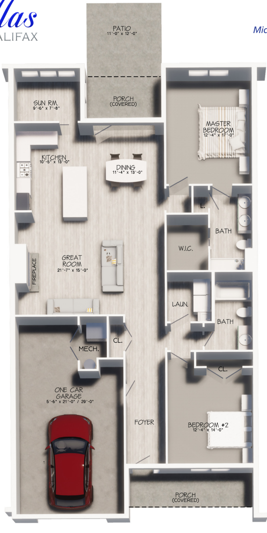
Actual unit is an exact reverse of the floorplan above.