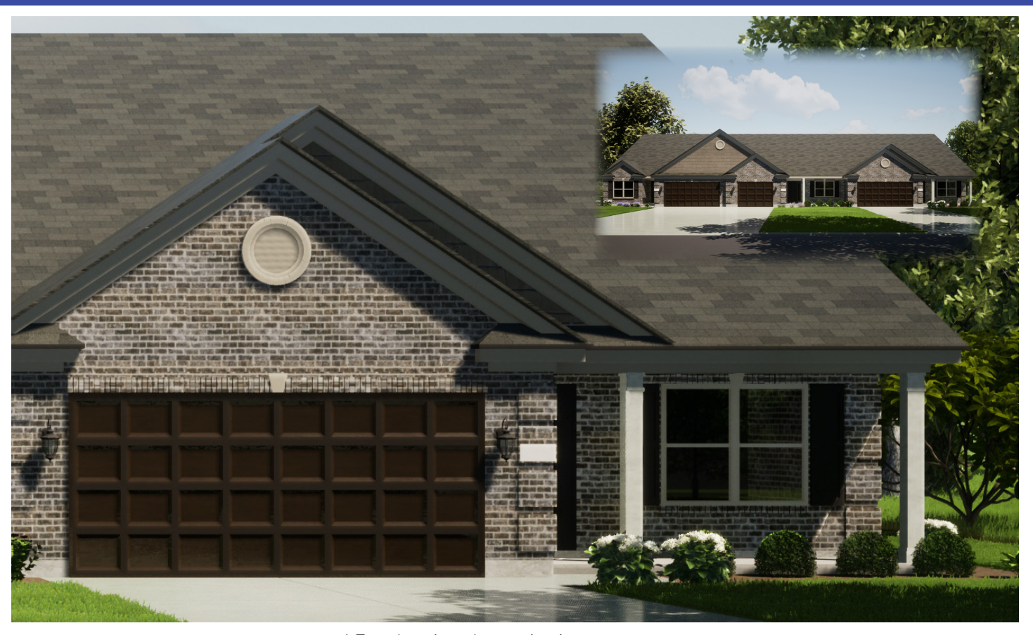
* Exterior elevation and colors may vary.

1201 East Bentley Troy, OH 45373 Right Unit - Plan A