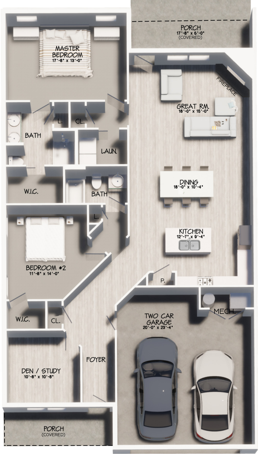
*Floorplan for 1201 East Bentley is a reverse of what is shown above.*

1201 East Bentley Troy, OH 45373 Right Unit - Plan A