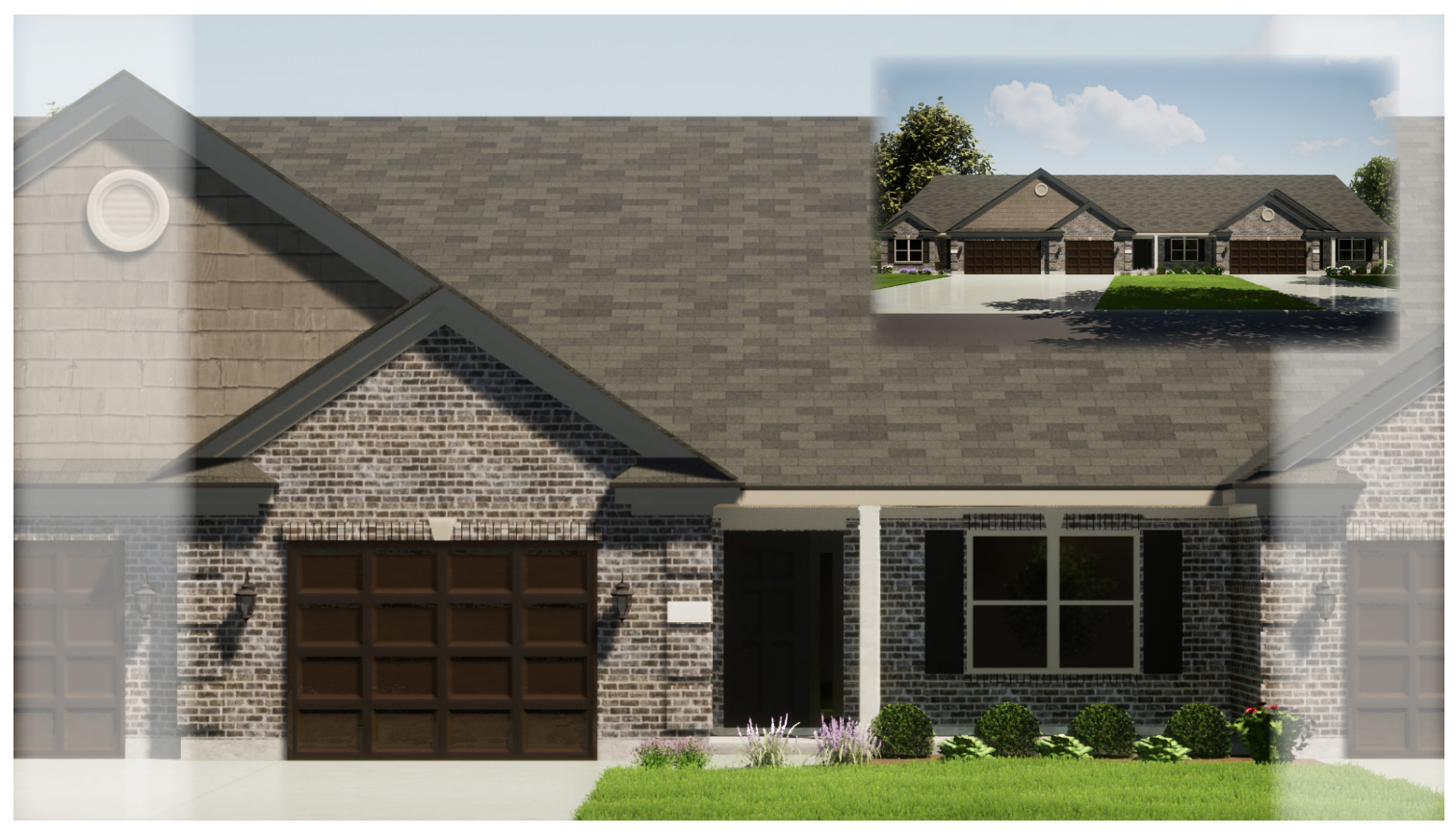
* Exterior elevation and colors may vary.

1105 East Bentley Troy, OH 45373 Middle Unit - Plan D